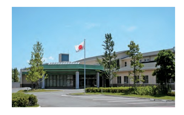
Osaka Juvenile Classification Home

As of 2013, there were 51 juvenile training schools, 50 juvenile classification homes, two branch juvenile training schools, and one branch juvenile classification home. Juvenile training schools house juveniles referred by the Family Court and provide them with correctional education. Juvenile classification homes house juvenile delinquents placed under "protective detention" by the Family Court. During protective detention, an expert report on the juvenile's personality and disposition is prepared, which will assist the Family Court's decision-making.