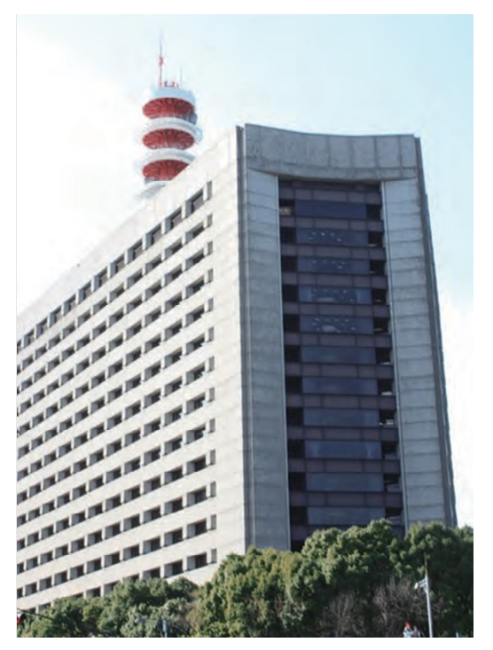
Tokyo Metropolitan Police Department

The Commissions exercise administrative supervision over the prefectural police by formulating basic policies and regulations for police operations. However, they are not authorized to supervise individual investigations or specific law enforcement activities of the prefectural police.