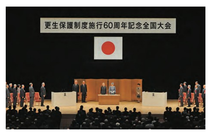
Ceremony for Volunteer Probation Officers

Volunteer probation officers are citizens commissioned by the Minister of Justice who co-operate with probation officers in providing various rehabilitation services to offenders. Their main activities are (i) to assist and supervise probationers and parolees; (ii) to co-ordinate the social circumstances of inmates; and (iii) to promote crime prevention activities in the community. They do not receive salaries: only a certain amount of their necessary expenses is reimbursed. As of 1 April 2013, 47,990 citizens were serveing as Volunteer Probation Officers.