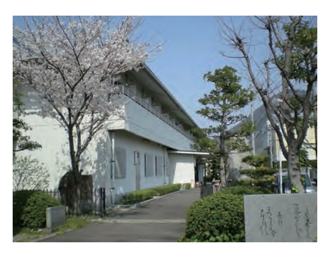
Offenders Rehabilitation Facility (Halfway House)

One hundred (100) of the Offender Rehabilitation Facilities are run by Juridical Persons for Offender Rehabilitation Services. The government supervises and provides financial support to such Juridical Persons and other entities that operate Offenders Rehabilitation Facilities.