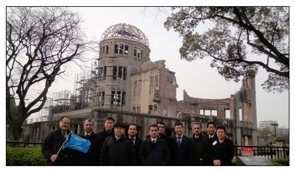
Study Tour (Hiroshima)