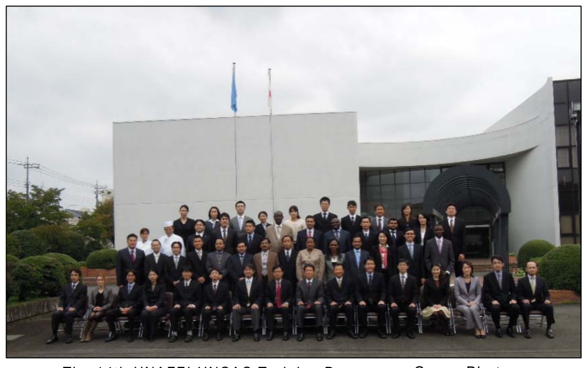
The 14th UNAFEI UNCAC Training Programme Group Photo