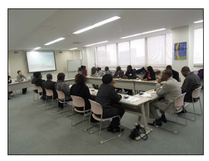
Observation Visit (Yokohama Probation office)